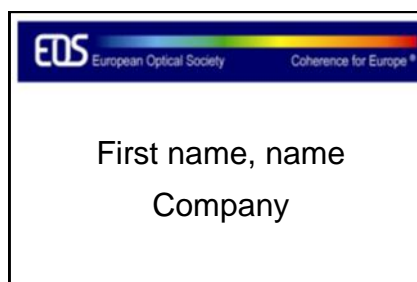
Front-side of the symposium badge. Every attendee will carry it and display your advertising.