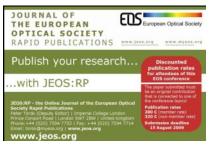
Back side of the symposium badge. Here could be your advertising!

Your advertising will be printed in full colours on the back of the delegate badges. This is a very exclusive advertising that is reserved to one company only!