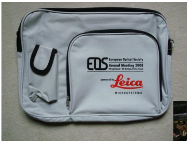
Example of an EOS delegate bag

(10% discount for EOS corporate members)