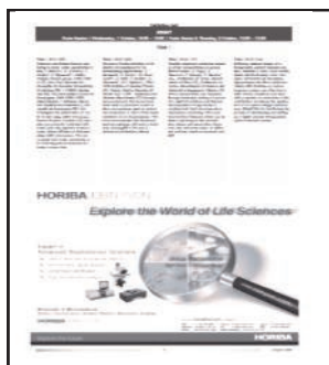
Example: 1/2 page ad b/w