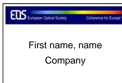
Front-side of the symposium badge. Every attendee will carry it and display your advertising.