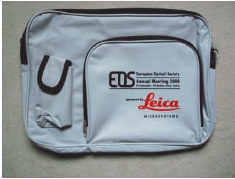
Example of an EOS delegate bag

(10% discount for EOS corporate members)